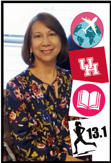
Dean of Students House – East 2

Attended the University of Houston and majored in Data Processing with a minor in Accounting. Prior to pursuing a career in education, I worked in the mortgage banking industry for twenty years and served as Senior Vice President of Investor Accounting.